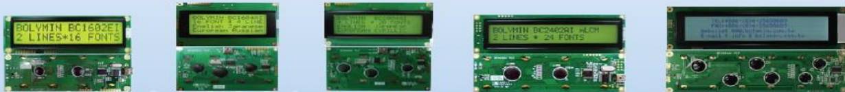
BC1602EI BC1604AI BC2004AI BC2402AI BC4004AI